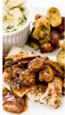
GRILLED CHICKEN BREAST