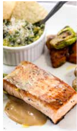
PAN ROASTED ATLANTIC SALMON