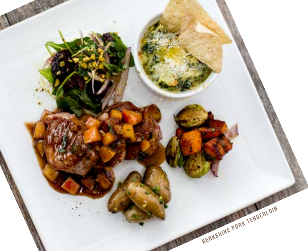
BERKSHIRE PORK TENDERLOIN